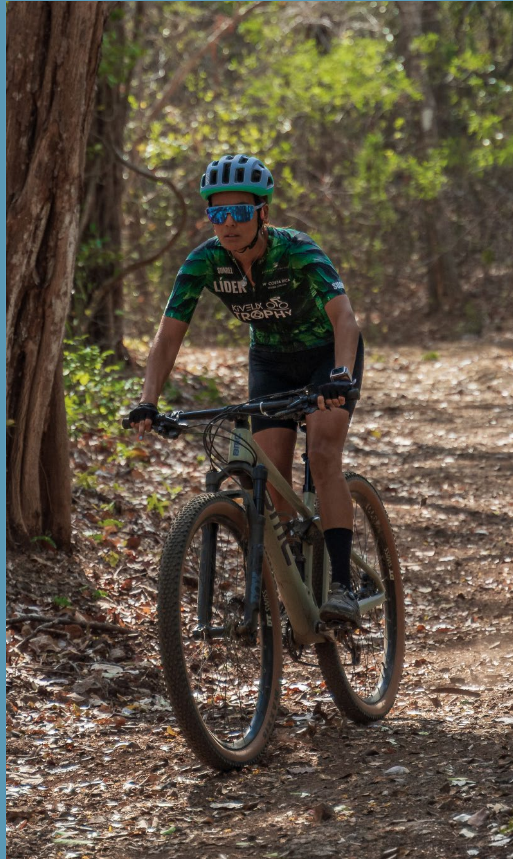
HEALTH & WELLNESS